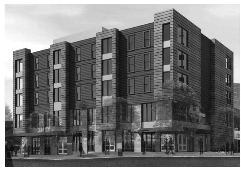
An artist's rendering of MBHP's new home, now being built in Roxbury Crossing.

Newer, small interview rooms to better ensure privacy.